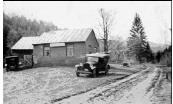
The West Fairlee Club House in early 1900's

Each summer during Aloha Camps' Show Weekend, members of our community volunteer to host visiting parents in their homes. For these accommodations, parents pay a modest fee which supports area charities, historic preservation and conservation projects. A list of these organizations is available on our web site.